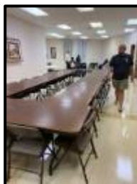
All Purpose Conference Room