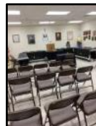
The Knights Room