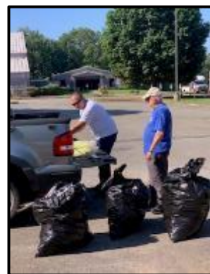
Loading up collected trash & debris for disposal.