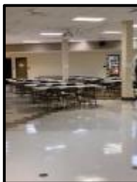
Conference area outside the Knights Room